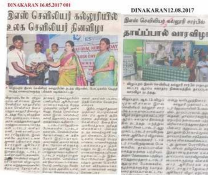
WORLD NURSES DAY CELEBRATION ON 12.05.2017