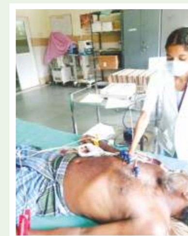
URBAN PRIMARY HEALTH CENTRE, VILLUPURAM