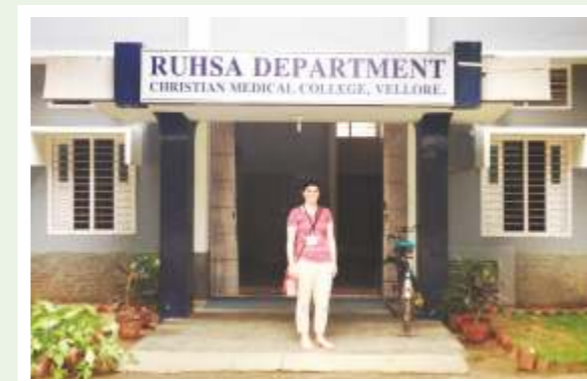
RUHSA, CMC – VELLORE