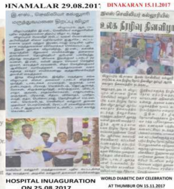
HOSPITAL INAUGURATION ON 25.08.2017