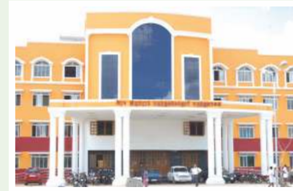
GVMC HOSPITAL, VILLUPURAM