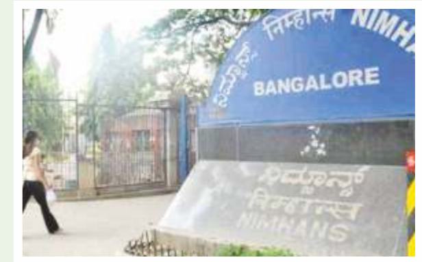
NIMHANS HOSPITAL, BANGALORE