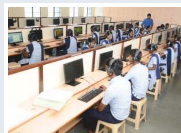
COMPUTER & LANGUAGE LAB