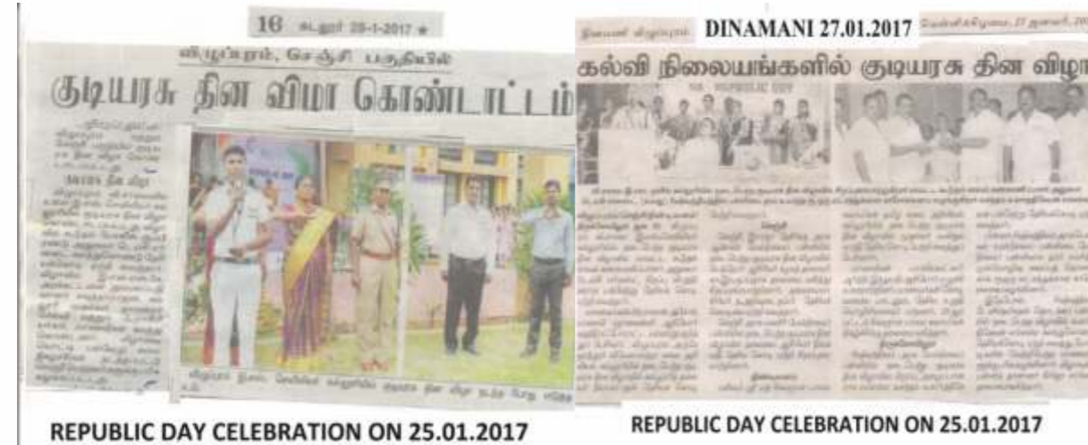
REPUBLIC DAY CELEBRATION ON 25.01.2017