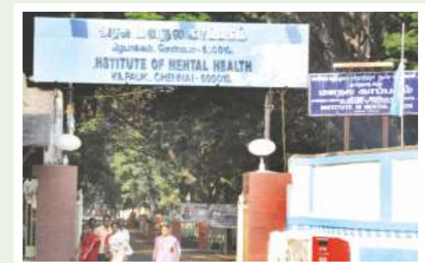
INSTITUTE OF MENTAL HEALTH, CHENNAI