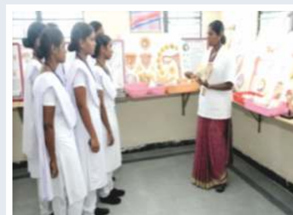
MATERNAL & CHILD HEALTH LAB