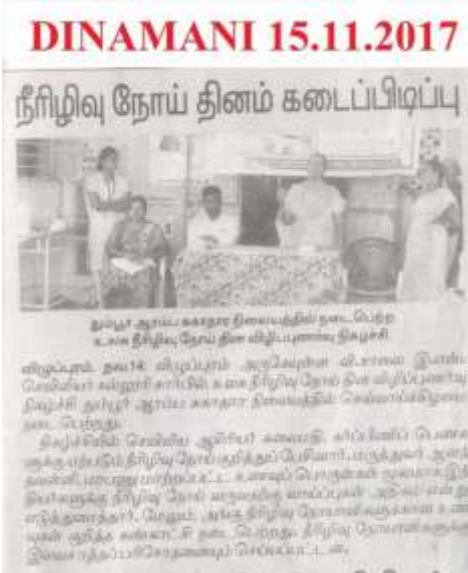
WORLD DIABETIC DAY CELEBRATION AT THUMBUR ON 15.11.2017