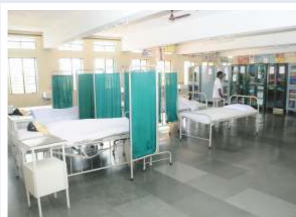
FUNDAMENTALS OF NURSING & MEDICAL & SURGICAL LAB

Fully equipped laboratories and pre-clinical labs are available for the students to get practical training in the college prior to their hospital training. The laboratories are