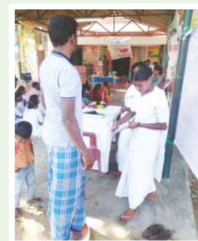
PRIMARY HEALTH CENTRE, THUMBUR