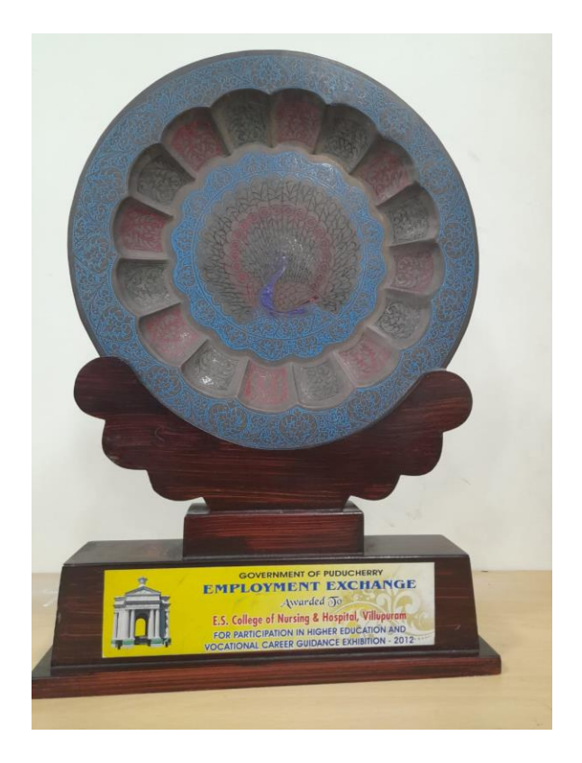
Government of Puducherry awarded E.S College of Nursing for participation in Higher Education and Vocational Career Guidance.