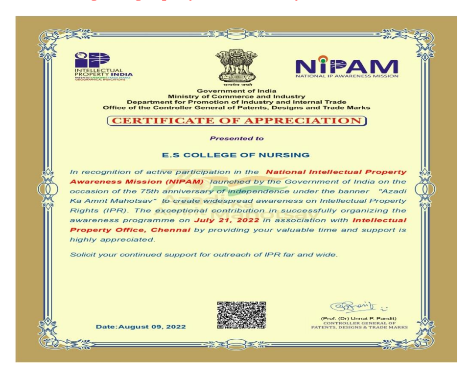
Government of India, Ministry of commerce and Industry appreciated E.S College of Nursing for active Participation in the NIPAM on occasion of 75<sup>th</sup> Independence Day under "Azadi Ka Amriti Mahotsav"